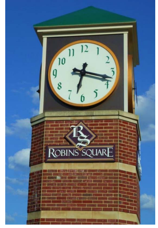
Robins Square clock tower

However, today that trend has changed. According to the recent survey (see survey results in appendix), attracting new business was the third highest issue in terms of importance to residents of Robins. Also, 57% of respondents agreed that Robins needed more business development and over 62% of respondents believed Robins should be more proactive in bringing business into town. That residential support provides the framework to grow Robins' economic development potential.