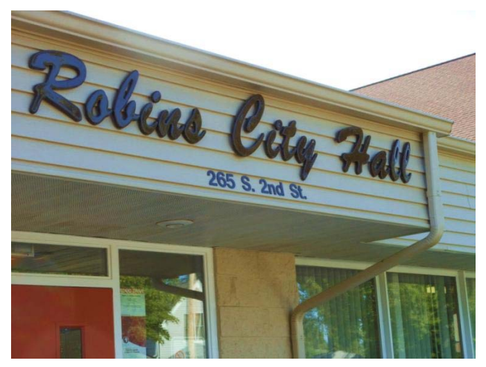
Robins City Hall

The plan has two fundamental purposes. First, it presents a unified vision for Robins articulated from the hard work and participation of the citizens who devoted their time and effort toward creating this plan. Secondly, it provides the legal basis for land use regulation such as zoning and subdivision ordinances.