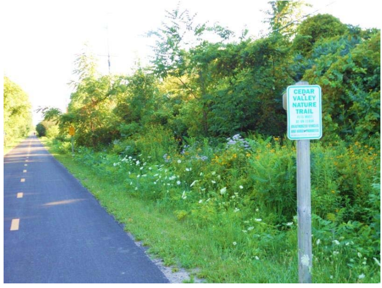
Cedar Valley Nature Trail through the City of Robins

As Robins grows, there will be a substantial need to expand public recreational activities. Families in the community will look to the city to provide safe and accessible services for both children and adults. The city is currently actively expanding the park area available to residents. There are two new planned park areas in the community. Other park areas can be established through provisions in the city's subdivision ordinance requiring park or open space in each new subdivision. The development of recreational facilities should include large park and open space areas with active recreational opportunities, in addition to connection to the city's expanding trail system.